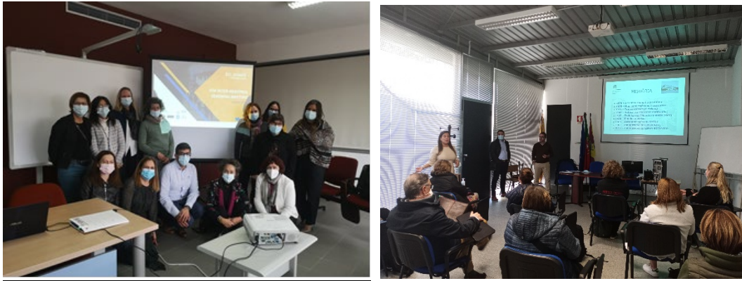
Figure 3 - Interregional Policy Learning Meeting of the EU_SHAFE Project